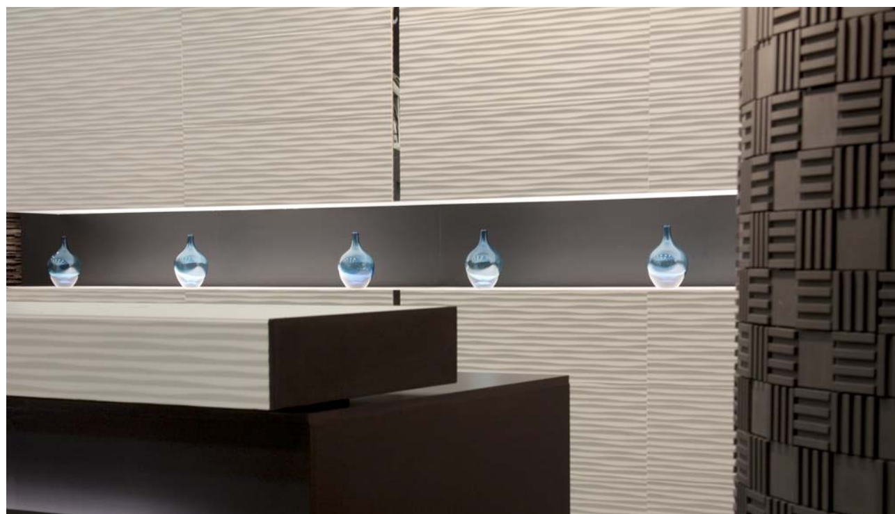
NEW AGATHOS RECT and SLITBEET