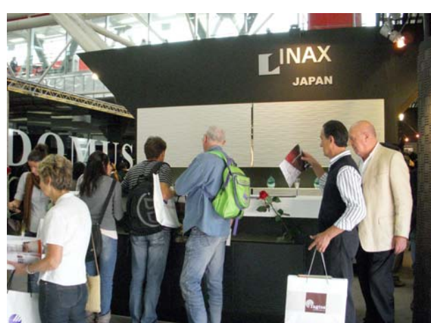
CERSAIE 2009, INAX Corporation Exhibition

CERSAIE took places 27th time this year as an international exhibition of ceramic tiles and household equipment, exhibitors are participating mainly from Europe and the globe for its 180,000m 2 exhibit space. The total exhibitors for the 2009 were 1,037 from 34 countries, and the total visitors are 83,137.